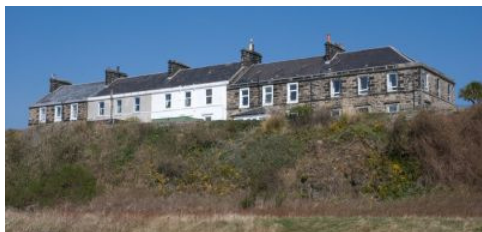
Pictured left - the doleritic sill at the Lammerlaws gives these houses a commanding view over the surrounding area.

Another exposure of dolerite - and a very obvious one, since there is less building here - is the Lammerlaws promontory, which has an eastern extension in Burntisland Bay represented by the Black Rocks outcrop. At the Lammerlaws the dolerite is badly weathered, displaying a typical reddish-brown colour as the iron oxide in the rock is exposed to water and air. Once again, we find areas of whin bushes so typical of areas of this rock type. The houses perched on the igneous outcrop overlooking the old railway marshalling yards behind the breakwater look to the old Parish Church sitting on the bluff formed by the sill. This steep-sided outcrop then continues westwards to Rossend Castle.