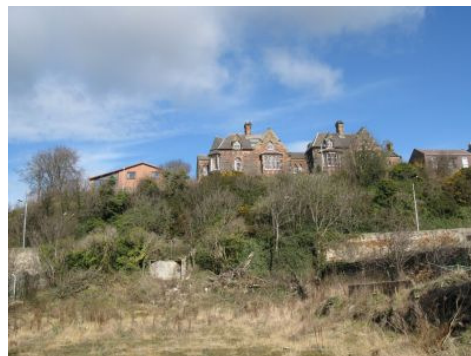
Above left - hard rocks form the Big Knowe on the Links. Above right - a gap in the High Street where the old Palace cinema used to be affords a unique view of the ridge of Broomhill.

Another exposure of dolerite - and a very obvious one, since there is less building here - is the Lammerlaws promontory, which has an eastern extension in Burntisland Bay represented by the Black Rocks outcrop. At the Lammerlaws the dolerite is badly weathered, displaying a typical reddish-brown colour as the iron oxide in the rock is exposed to water and air. Once again, we find areas of whin bushes so typical of areas of this rock type. The houses perched on the igneous outcrop overlooking the old railway marshalling yards behind the breakwater look to the old Parish Church sitting on the bluff formed by the sill. This steep-sided outcrop then continues westwards to Rossend Castle.