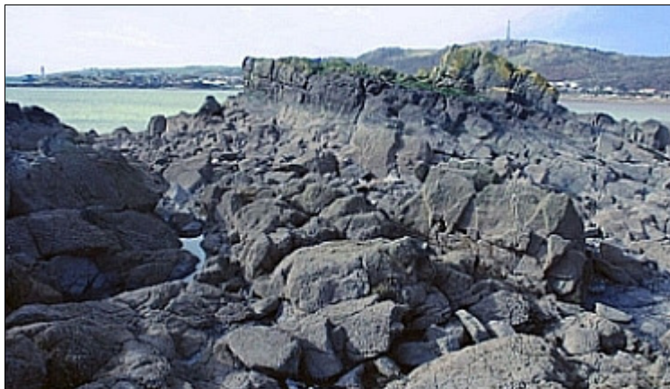
Above left - the Black Rocks viewed from the Lammerlaws at low tide, with the volcanic plug of the Bass Rock in the distance. Above right - close-up of the Black Rocks, with the Binn in the background. Below - breakwater, constructed with dolerite blocks from the Lammerlaws quarries.