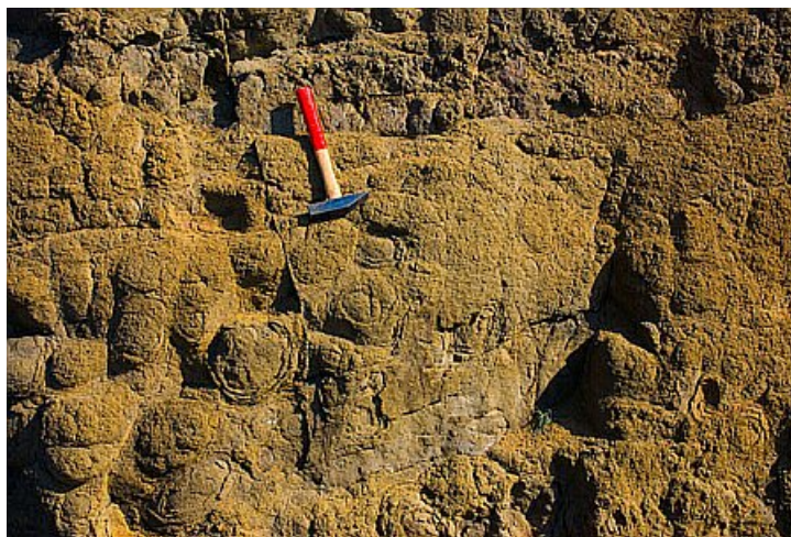
Below - spheroidal weathering of badly eroded dolerite at the Lammerlaws. The hammer measures 30 cm in length.

Behind the platform at Burntisland railway station good examples of spheroidal weathering of the dolerite can be seen. Here weathering has caused the outer layers of the dolerite to peel off like the layers of an onion (the process is also termed onion-skin weathering).