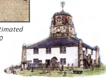
The Parish Church of St Columba