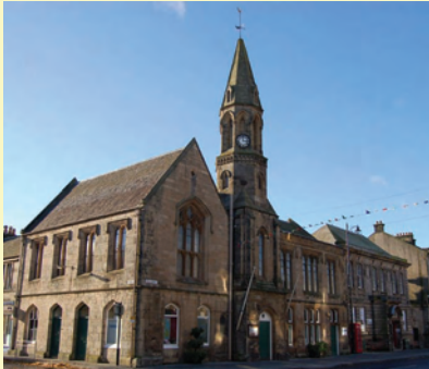
Burgh Chambers, Library and Heritage Centre

The annual heritage exhibition is the Trust's core activity. It has been held every year since 1994. The exhibitions have attracted many thousands of visitors from Burntisland itself, from other parts of the UK, and from many other countries. An increasing number of the visitors are family history researchers.