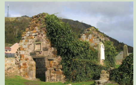
The Medieval Church of St Adamnan