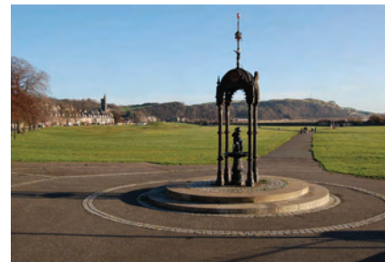
The Links from East Porte