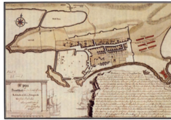
Burntisland 1745 – estimated population 1300

In 1998 the Trust set up the Charles wRex Project to search for the wreck of the 'Blessing', King Charles I's baggage ferry which sank off Burntisland in 1633. Much work has been done.