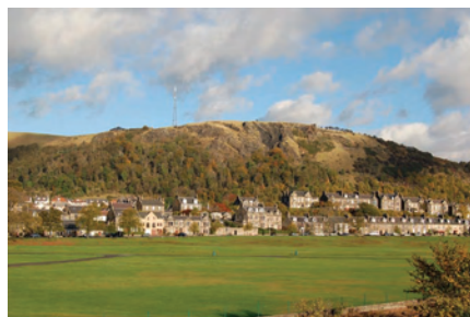
The Links and Binn from Lammerlaws Bridge

A Burntisland Heritage Trust Publication Funded by Burntisland Development Trust.