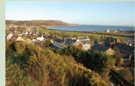
From Broomhill Viewpoint