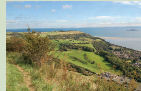
From the Binn